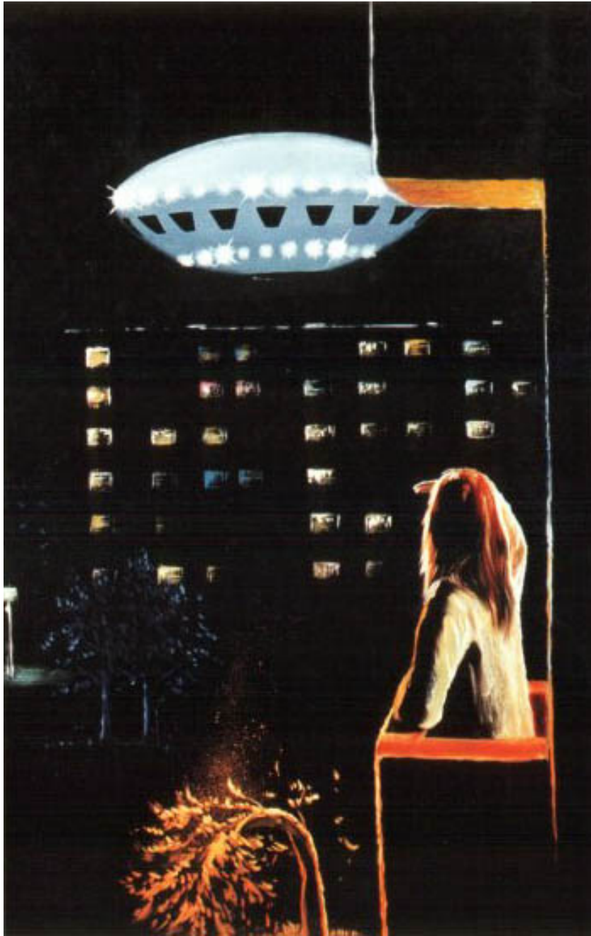
Fig. 1: May, 21st 1994: An unknown object flies through a street in Plauen, Germany. It illuminates a small oak-tree and lets it shake as in a storm. (Drawing: Gabriele Berndt)